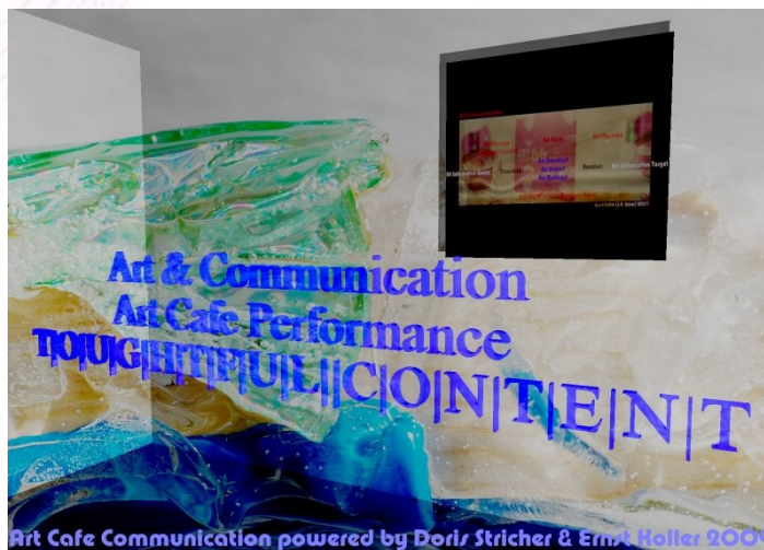
Art Cafe f/2 |T|H|E| |C|O|I|M|M|U|N||C|I|A|T|I|O|N| |C|A|F|E| with |T|O|U|G|H|T|F|U|L| |C|I|O|N|T|E|N|T|

I often have my camera with me, i can photograph in any place, any time, though i don't necessarily do that. It's an adventure on every street and forest corner. Sometimes for fun, i mentally take pictures without a camera... It's astonishing how persistent these images can be. Sometimes paintings, drawings or poetry inspires me, or dreams, memories that return. To respond to these impulses, i recently experimented with sessions in places where i know when the light is at its best, finding models and getting their permission, their participation for a simple production. I really like this way of working. It requires organization, presents many obstacles, but it's exalting work, to get as close as possible to what one is looking for. I discovered recently Jorge Molder whose work denies a unique reality for the benefit of a world with multiple possible. Carrie Levy's portraits with naked models in their own house, who diverting their faces inviting you in the identification... Or still Bill Armstrong and his fabulous suggestion of color portraits. This sum-