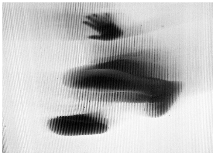
Art Cafe f/2 Exhibition with Zébulon Rouge "Lucy in the sky".

I seek a strength of feeling capable of overturning. It's an attempt at writing poetry through photography, the forms of which are constantly moving outwards. Beyond representation. I wanted to obtain images which diffuse out of their frames, stories with multiple interpretations. Sometimes i use water and smoke as unpredictable revealers. There ephemeral architecture remind us of